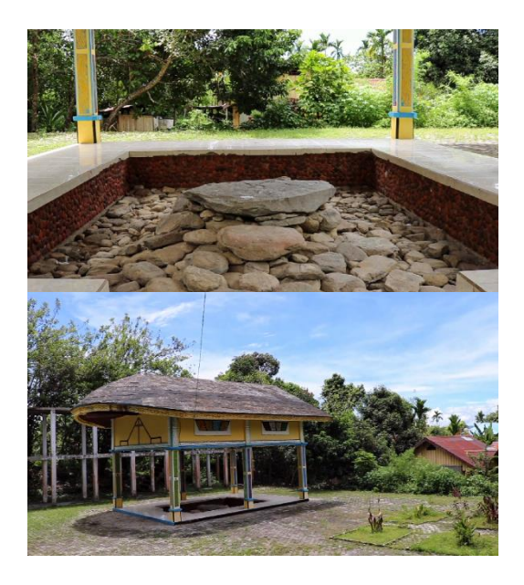
Fig 1. Sedimentation Stone in Wondama Bay