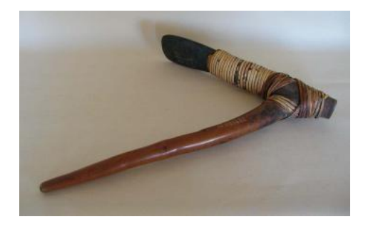
Fig 2. Neolithic Papua Axe