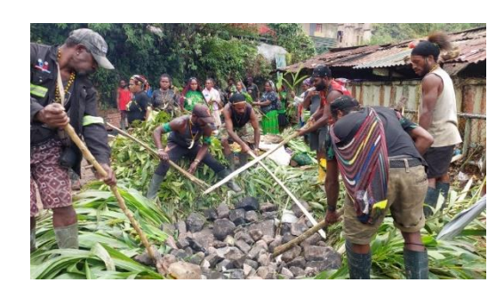
Fig 2. Stone Burning Tradition

can be burned to release energy and provide heat and light through combustion. The stone-burning ritual tradition means cooking by burning stones. The stone-fired method for preparing food can still be found in the culture of local people in the interior of the central mountains of Papua, known as the Dani or Ndani people or tribe. The stoneburning process is carried out first by making a small hole to insert the stone to be burned; after the stone becomes hot, the food ingredients to be cooked, such as pork, tubers, and leaves, are supplemented with vegetables. Epistemologically, stone burning comes from the local community's language, which has various names. In the Lani area, it is called lago lakwi . In contrast, in the Bintang Mountains, it is called hupon . In Wamena, stone burning is known as kit abo isogo, and the Nduga people call it kerep kan and are called mogo gapil in the Panyai community [34]. The ritual tradition of stone burning is practiced in various social events in Papua as an expression of gratitude to the giver of life in welcoming ceremonies for births, marriages, and deaths. Ritual is a means of communication with the divine or transcendent nature, so the stone-burning ritual that is carried out becomes a form of life history and beliefs held by traditional communities.